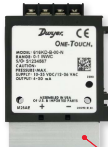
Optional NPT connection block